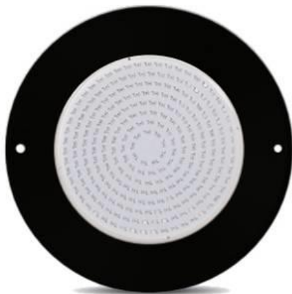
35 / 18 W