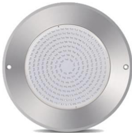
35 / 18 W