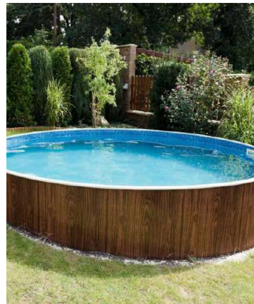
Aqua-Mini Pump is designed for above ground pools