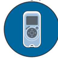
Remote control unit