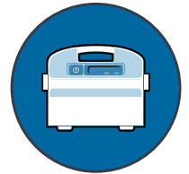
Filter indicator on power supply