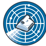
CleverClean scanning system