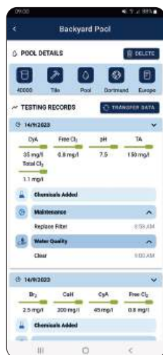
Pool specific dashboard for test results