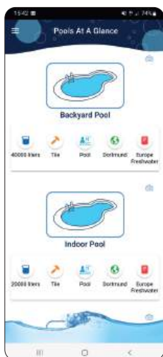
Manages 5 pools at the same time